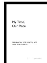
My Time, Our Place; Framework for School Age Care in Australia

Critical reflection: Reflective practices that focus on implications for equity and social justice ( Early Years Learning Framework – refer to Sources ).