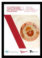
Victorian Early Years Learning and Development Framework

Approved learning framework: A document that outlines practices that educators and co-ordinators must use to support and promote children’s learning. The Early Years Learning Framework (Belonging, Being & Becoming) , the Victorian Early Years Learning and Development Framework and My Time, Our Place; Framework for School Age Care in Australia are approved learning frameworks for use in Victoria ( refer to Sources ).